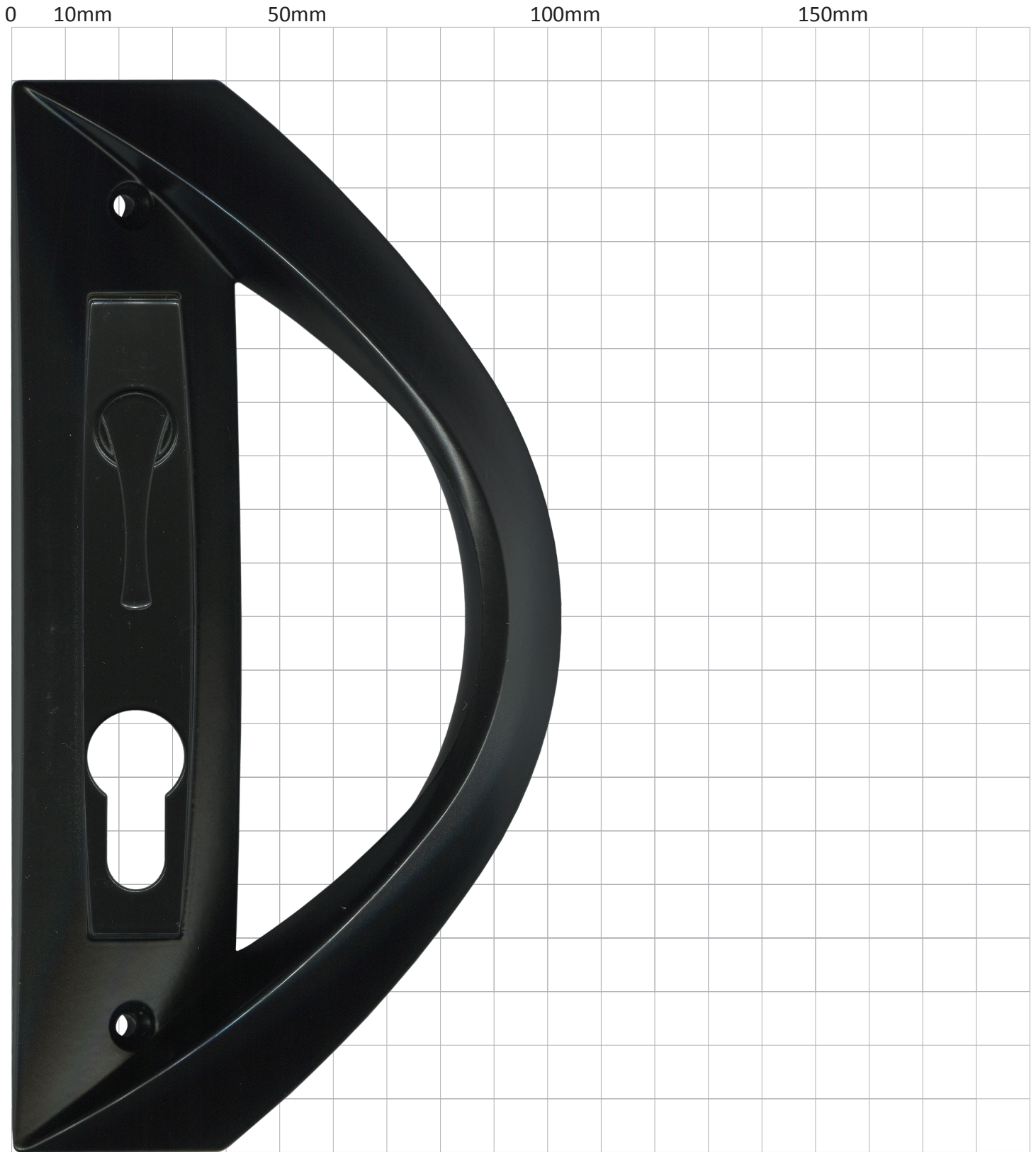
Grid scale is 10mm.

NSW & ACT (03) 9786 0333 salesnsw@total-hardware.com.au